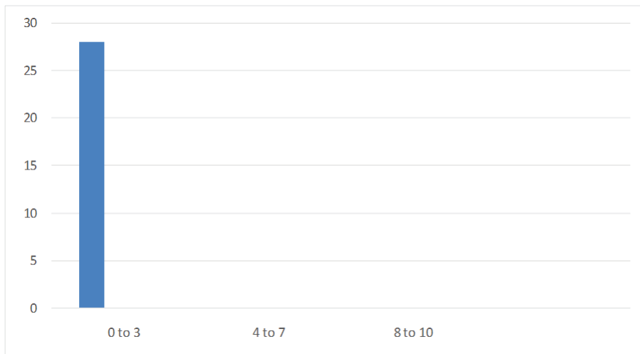
Figure 3: Tolerance to procedures performed by analogous pain scale.