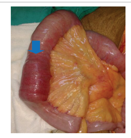
Figure 2: Impacted stone in bowel