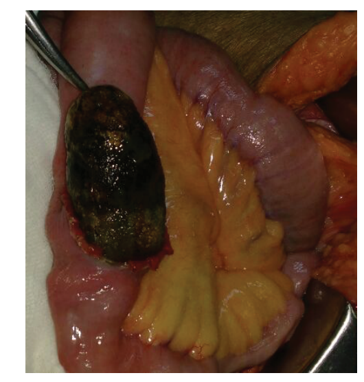
Figure 3: Stone after enterotomy

and alteration in the site of previously observed gallstone. Earlier it was difficult to diagnose gallstone ileus but with the advent of new imaging techniques like Computed Tomography (CT) scan and Magnetic Resonance Imaging (MRI), the task has become much easier [6,7].