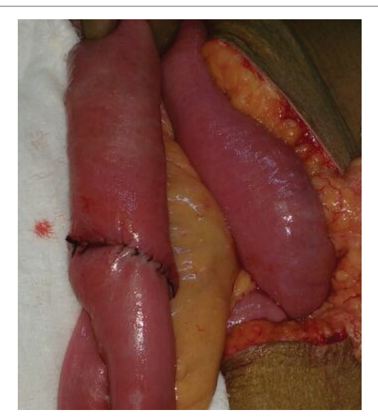
Figure 4: Primary Repair of enterotomy

only to highly selected patients with absolute indications for biliary surgery at the time of presentation in a patient fit for tolerating both operations [9]. The patient has to be followed if the patient present with cholecystitis then cholecystectomy is required. Most of the time patient remains asymptomatic for a gallbladder problem. In more than 50% of cases, the fistulous tract closes spontaneously [7]. It has been noted that 5% of patients who undergo enterolithotomy alone come with a relapse of biliary symptoms and 10% require an unplanned reoperation. The laparoscopic technique may be considered as an option to treat such cases [8,10].