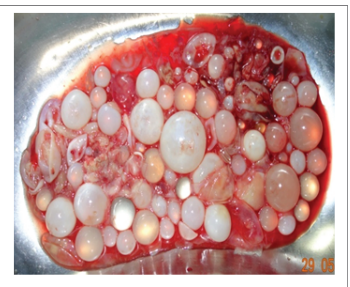
Figure 4: Multiple Daughter Cysts

cyst have been reported in neck, trunk and proximal part of limbs, may be because of relatively less muscle contraction in these areas [6,7]. Hydatidosis presenting as a painless, gradually progressive swelling should be included in the differential diagnosis of soft tissue swellings especially if the patient gives history of agricultural background or has been in contact with livestock.