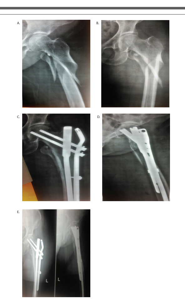
Figure 2: (A and B): A female patient, aged 55 years, presented with an unstable trochanteric fracture with broken lateral wall (C and D): Immediate post-operative radiograph, showing the fracture

(C and D): Immediate post-operative radiograph, showing the fracture reduced and stabilized with an intramedullary nail in combination with a TSP (E): Radiograph at the 3-month follow-up