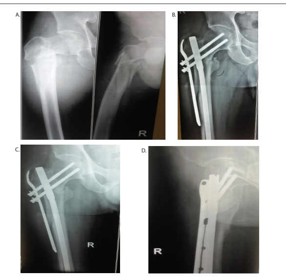
Figure 3: (A): Radiographic picture taken from a male patient, aged 30 years, following a high energy trauma

(C and D): Immediate post-operative radiograph, showing the fracture reduced and stabilized with an intramedullary nail in combination with a TSP (E): Radiograph at the 3-month follow-up