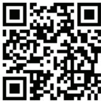
Figure 2: QR code of "Epiketon".