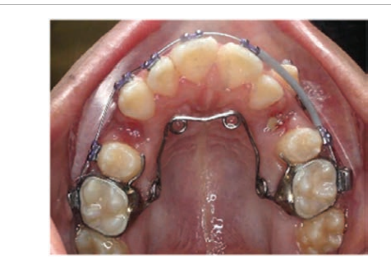
Figure 4: Retention period of quad helix appliance after maxillary expansion.

Figure 3: Mini-screw insertion between #25 and #26 and segmented T-loop activated and cinched back with V-bend in the arm to counteract the moment of canine retraction.