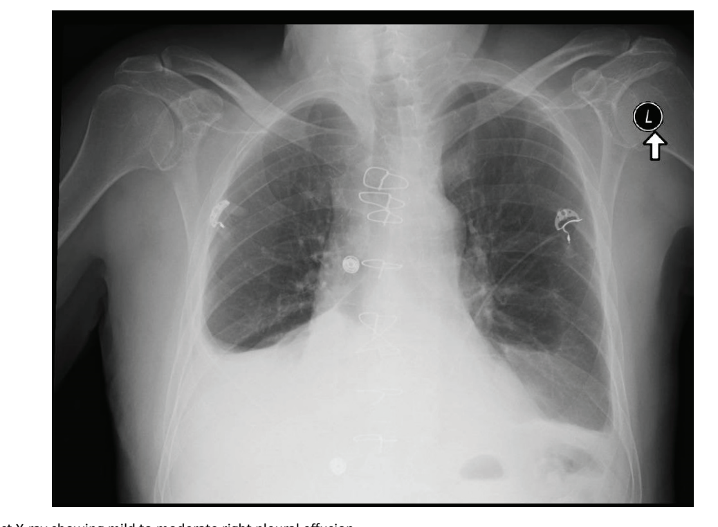
Figure 1: Chest X-ray showing mild to moderate right pleural effusion.

air entry to the right lung and a + 2 bilateral pitting leg edema. Chest X-ray revealed recurrent large right pleural effusion (Figure 2). Chest CT scan showed the same large right pleural effusion and additional small pericardial effusion, no pericardial thickening, no enlarged lymph nodes and no other additional finding. Recurrent thoracentesis was performed revealing the same prior findings without evidence of underlying etiology. A transthoracic echocardiogram revealed a minimal diastolic dysfunction, enlarged left atrium, minimal pericardial effusion, no respiratory flow variation and an enlarged inferior vena cava (2 cm) with non-significant collapse during inspiration indicating high right atrial pressure.