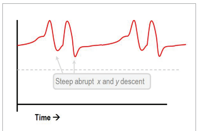
Figure 3: Jugular venous pressure waveform showing prominent x and y descents of venous and atrial pressure.

Figure 2: Chest X-ray showing augmentation of tight pleural effusion despite treatment.