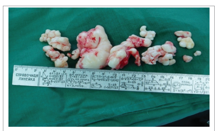
Figure 3: Intraoperative findings: rounded loose bodies and bodies attached to the synovial

months later, the patient had achieved total recovery of strenght with complete symetric restoration of motion.