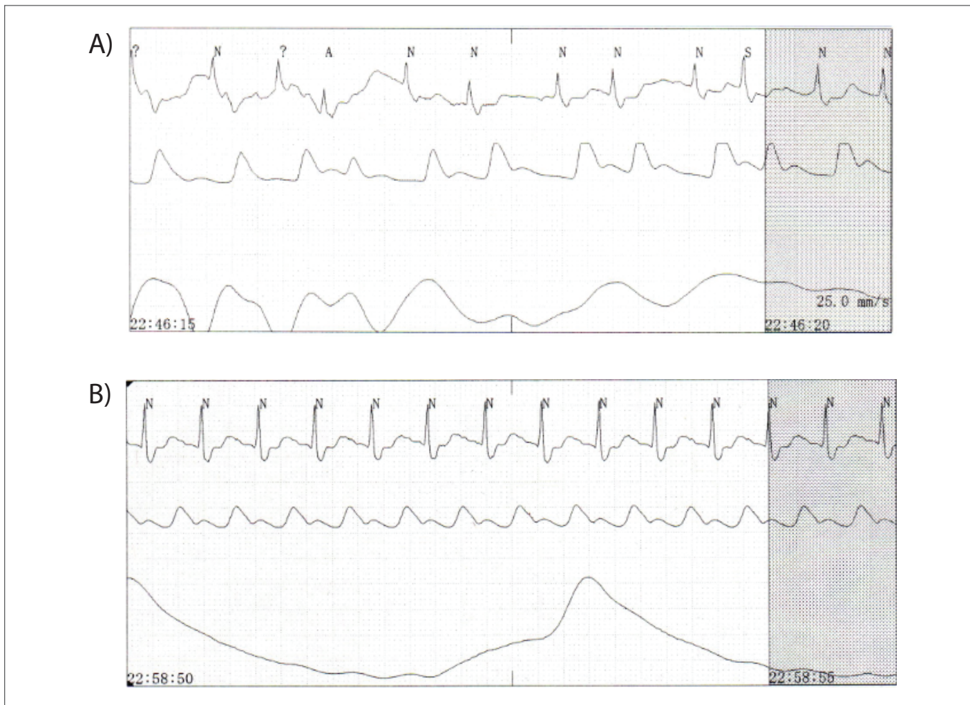
Figure 2: A. An ECG after the patient's heartbeat was restored. Atrial fibrillation rhythm. 22:46:15~22:46:20. B. An ECG 10 min after the patient's heartbeat was restored. Sinus rhythm. 22:58:50~2258:55

bradycardias and arrhysmias thereafter. Echocardiography performed after the asystolic episode did not detect any changes.