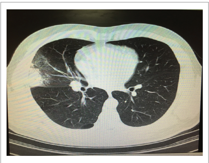
Figure 3: Chest CT scan.

anticoagulation, ischaemic strokes occurred in 2 patients. They suggested that acute ischaemic stroke accompanying COVID-19 infection may have distinct characteristics, with implications for diagnosis and treatment [15].