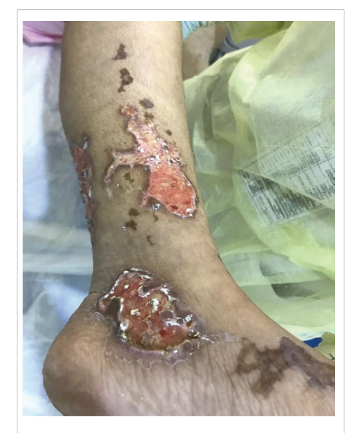
Figure 3: Follow up after 3 weeks from the start of treatment, vascular compromised results in tissue necrosis but also wound healing taking place.

connective tissue disease. The treatment plan of this patient was to start on Rituximab 1000 mg single dose, Aspirin 100 mg po od, Paracetamol 1 g IV, Clexane 60 mg subcutaneous q12h, Tramadol 50 mg IV PRN q12h, Prednisolone 70 mg tab OP OD, Calcium Carbonate 600 mg OP OD, Cellecept 500 mg PO BID and betamethasone topical cream. Close observation was maintained to adjust the immunosuppressant.