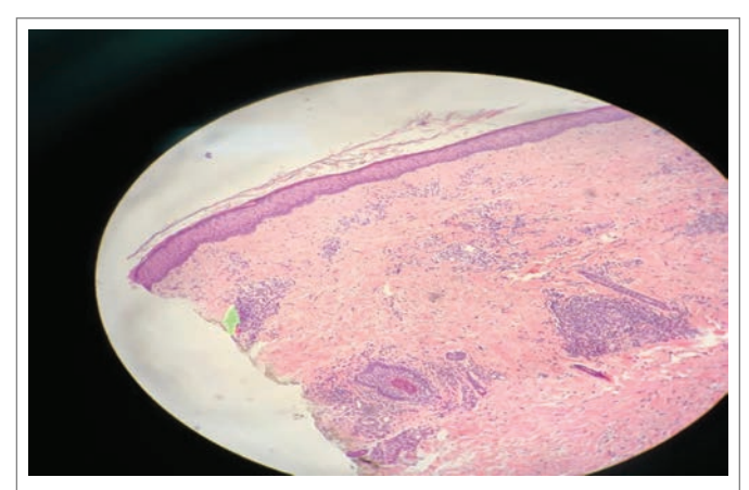
Figure 4: Histopathological picture of the lesion and shows both small and medium vessels vasculitis with perivascular inflammation and panniculitis.