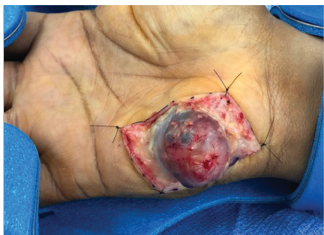
Figure 1: Intraoperative image of the mass within muscle of the hypothenar compartment.