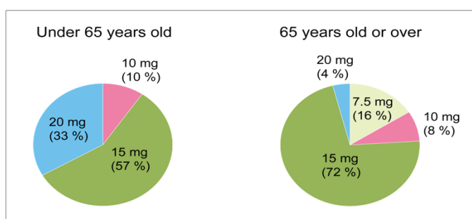
Figure 3: The final dose of suvorexant

We analyzed the final dose of suvorexant depending on the age groups. In patients under 65 years old, 20 mg was 33%, 15 mg was 57% and 10 mg was 10%. In patients 65 years old or over, 20 mg was 4%, 15 mg was 72%, 10 mg was 8% and 7.5 mg was 16%. Since the medication was only available in 20 mg and 15 mg tablets in Japan, we recommended the patients to cut and only take half of the medication, if they experienced hangover effects.