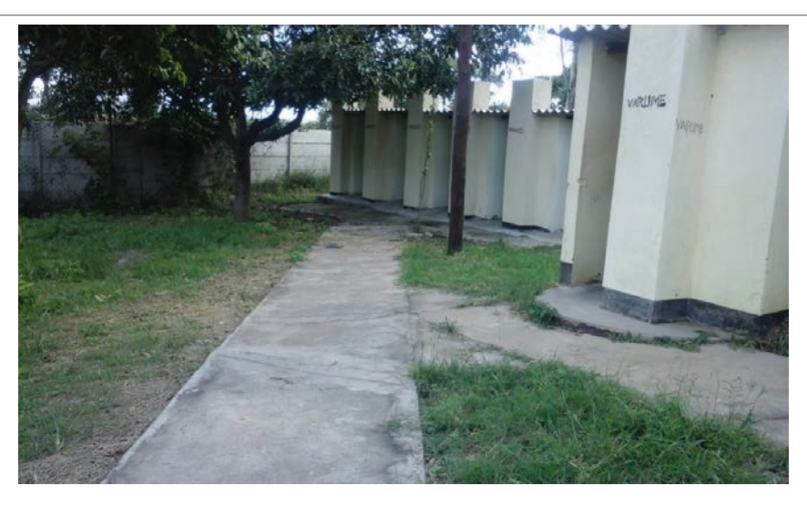
Figure 1: Blair toilets at a local hospital in Zimbabwe.