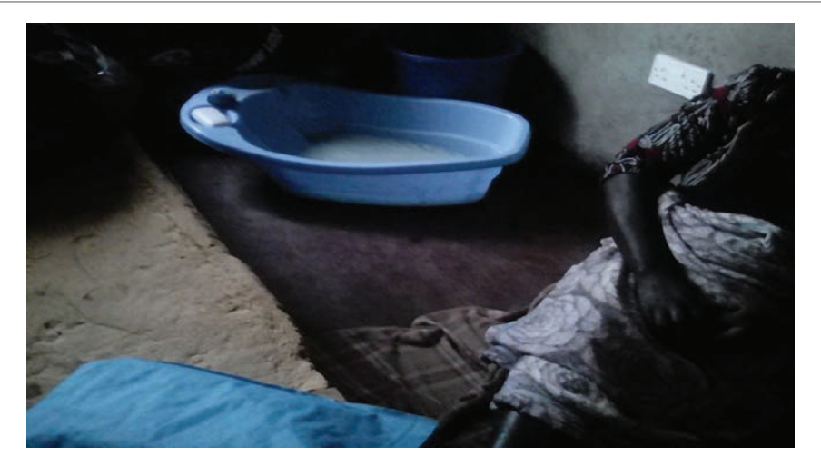
Figure 10: Seated in home labour room is the woman who assists in delivering of babies.