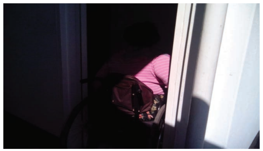
Figure 5: Woman in wheelchair forcing her way through the narrow toilet entrance at a local clinic.