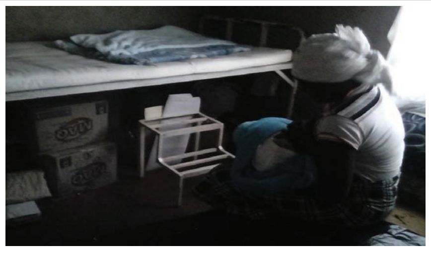
Figure 9: A woman breast feeding a newly born baby delivered in the home.