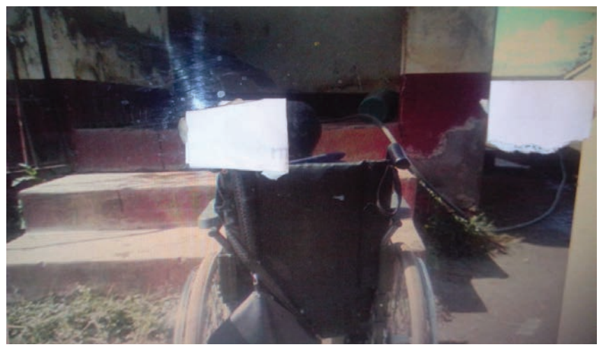
Figure 7: Girl Child in Wheelchair at Toilet Entrance.