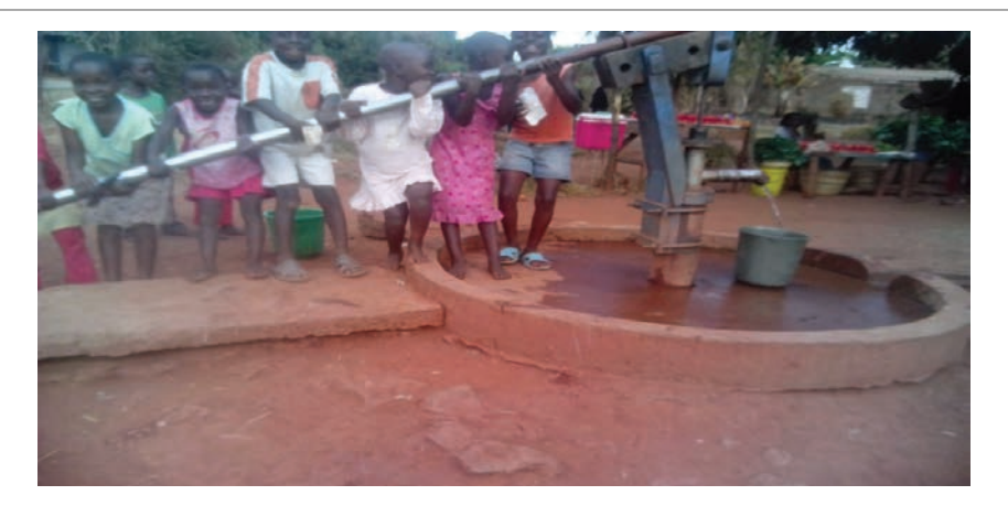
Figure 3: Public Water Boreholes. Source: Chigunwe, 2014 [9]