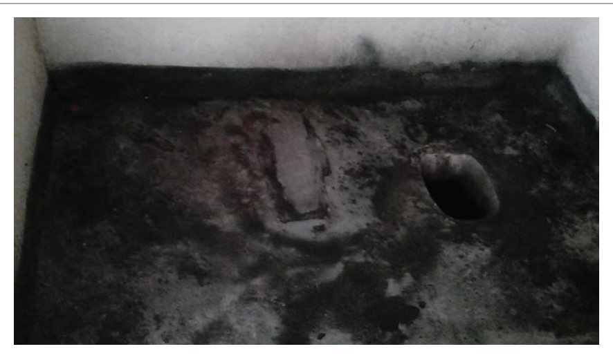
Figure 2: Blair toilet squatting hole.