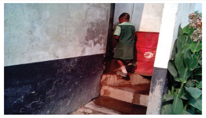
Figure 6: Steps at school toilet entrance.