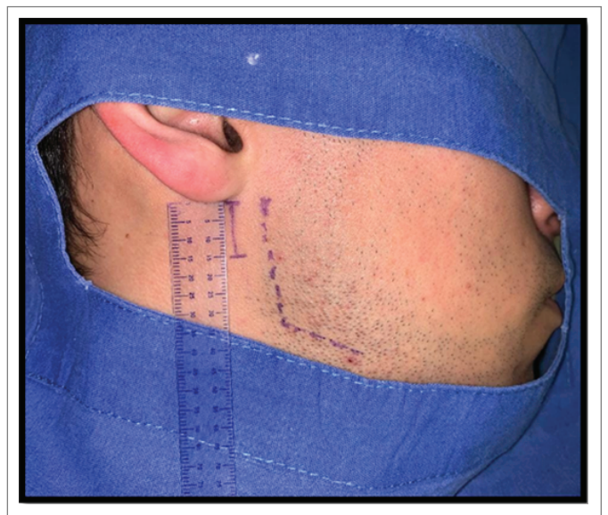
Figure 1 : Surgical marking prior to incision, starting from immediately the origin of the ear lobe, it continues on the posterior border of the mandibular ramus with an extension no greater than 3cm.

4. Reduction: To carry out the reduction of subcondylar fractures, different techniques have been described that allow the mandibular ramus to be displaced caudally. We suggest the use of a McKesson gag, which is placed in the most posterior region of the fractured side to descend the mandibular ramus producing the reposition of the mandibular condyle within the glenoid cavity when the ideal position of the condyle is achieved; we proceed to perform the fixation with the use of condyle plates. The author suggests the use of a trapezoidal plate with four holes; the mouth gag is removed and the mandibular function is verified; the occlusion is corroborated and the closure of the wound by planes is continued emphasizing the closure of the parotid capsule to avoid fistulas. For the skin closure, a subdermal suture is performed. (Figures 2-4)