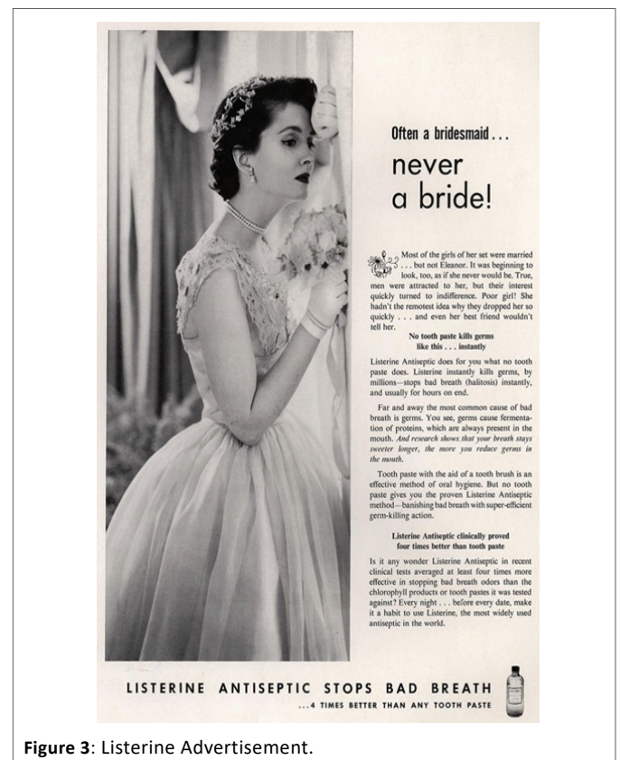
Figure 3: Listerine Advertisement.

Some experts have raised concern that the use of alcohol-containing mouthwash such as Listerine may increase the risk of