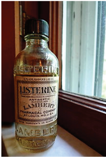
Figure 2: Listerine Antiseptic.