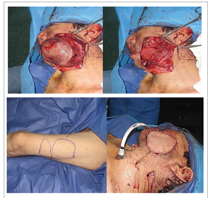
Figure 1 : A 37 yrs male with history of recurrent dermatofibrosarcoma protuberance. The tumor resected with 3 centimeters margin. Then a double paddle anterolateral thigh free flap created which one paddle used for lining and another for coverage of the through and through defect.

International Journal of Dentistry and Oral Health Open Access Journal