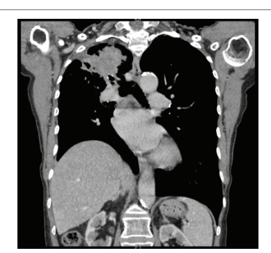
Figure 1: CT taken on initial presentation showing a RUL lesion.

Antibiotics, IVIG*, platelet transfusions and red cell transfusions, were ineffective. Platelets recovered marginally after a combination of IVIG and platelet transfusions but required another round of therapy within one to two days. An autoimmune work-up was negative for the following: c-ANCA*, p-ANCA*, and DAT* (Broad Spectrum Coombs, Anti-IgG Coombs, and Complement). The rest of the autoimmune workup was within normal limits with exception to ANA*: C3 complement 1.01 g/L